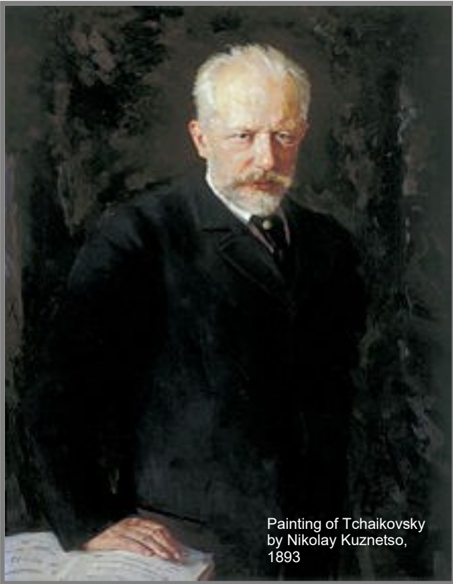
Painting of Tchaikovsky by Nikolay Kuznetsov, 1893

In 1877, a wealthy widow started to subsidize Tchaikovsky, a relationship that lasted fourteen years. There was one strange condition to the widow's financial support—they were never to meet. With this financial independence, he was able to resign from the Conservatory in 1878.