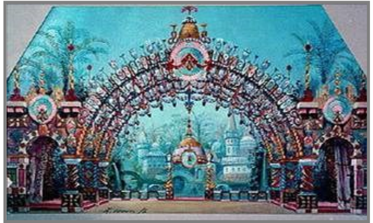
Original sketch for the set of The Nutcracker , Act II, 1892

The ballet wasn't particularly popular in Russia and was performed only sporadically and in